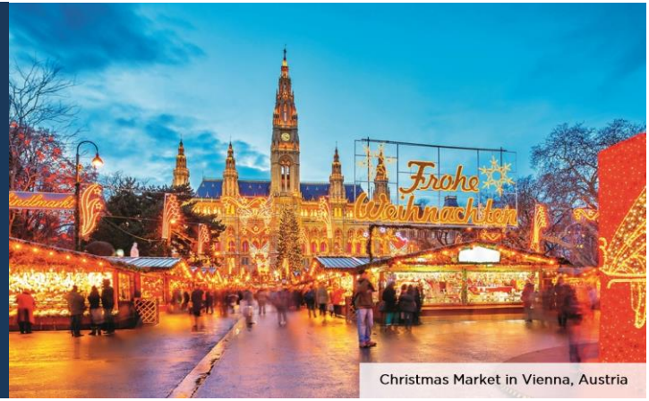
Christmas Market in Vienna, Austria

7-night cruise from Budapest to Nuremberg December 5-12, 2026 | AmaMora